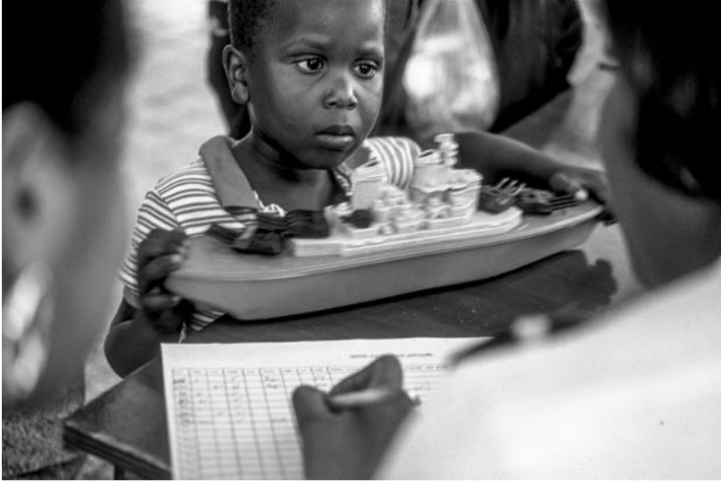
2.6 Haitian boat people.

a young Black girl. One pulls back so that the other details I described become visible: the gown, the leaf, those big brown eyes with their impossibly long eyelashes and an uncovered wound under the right one, the stretcher and the cold pack. In addition to indexing all that Glover cautions us to keep in mind, we might allow that the label Ship is expedient, that the people who put it there are trying to help, that it's a signifier of medical necessity in the midst of disaster and the disorder that follows. Someone wanted to mark this girl child for evacuation, wanted to make sure she got on that ship. But an allowance for intention aside, one of the larger questions that arises from the image is how does one mark someone for a space — the ship — who is already marked by it ?