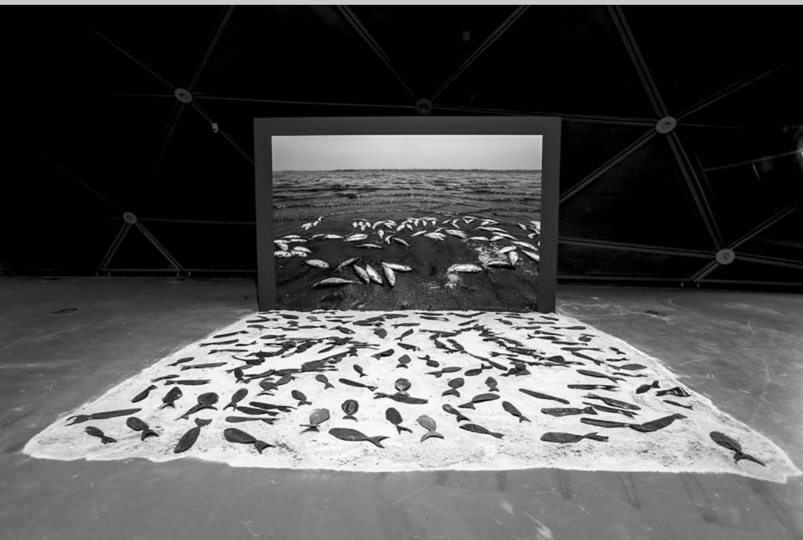
2.13 Romuald Hazoumè, Lampédouzeans , 2013. Mixed media installation, 220 × 360 × 380 cm. Image courtesy of October Gallery. © 2015 Artists Rights Society (ARS), New York/ADAGP, Paris