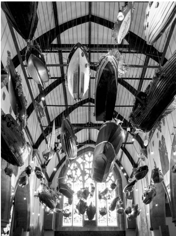
2.12 Hew Locke, For Those in Peril on the Sea , 2011 (installed in the Church of St. Mary & St. Eanswythe, Folkestone). © Hew Locke. All rights reserved, DACS 2015