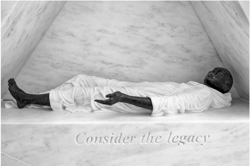
2.8 A close-up from the memorial on the legacy of slavery.