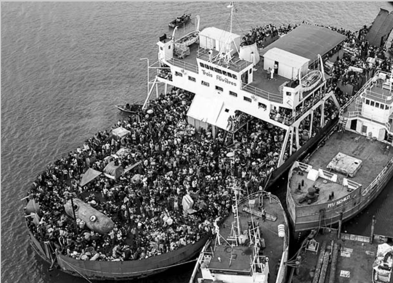
2.10 Operation Unified Response.