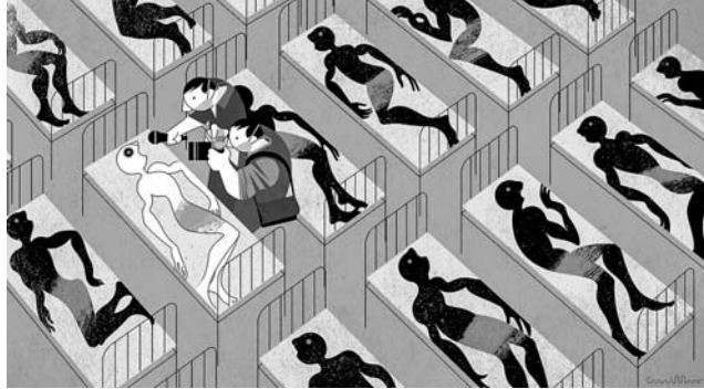
2.11 Ebola cartoon. Courtesy of André Carrilho