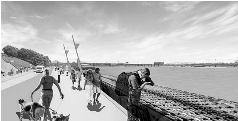
2.14–2.15 Renderings of Moving Chains , by Charles Gaines, a potential project to be located along a riverbank. Courtesy of the artist. © Charles Gaines 2015